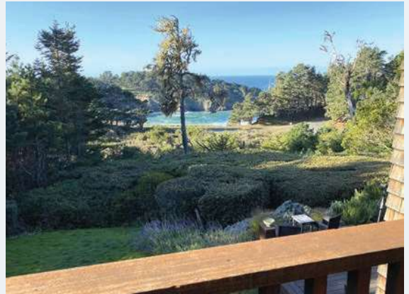
View from the deck

More things to do in Mendocino: https://berkeleyandbeyond.com/Northern-California/Highway-1/highway-1.html